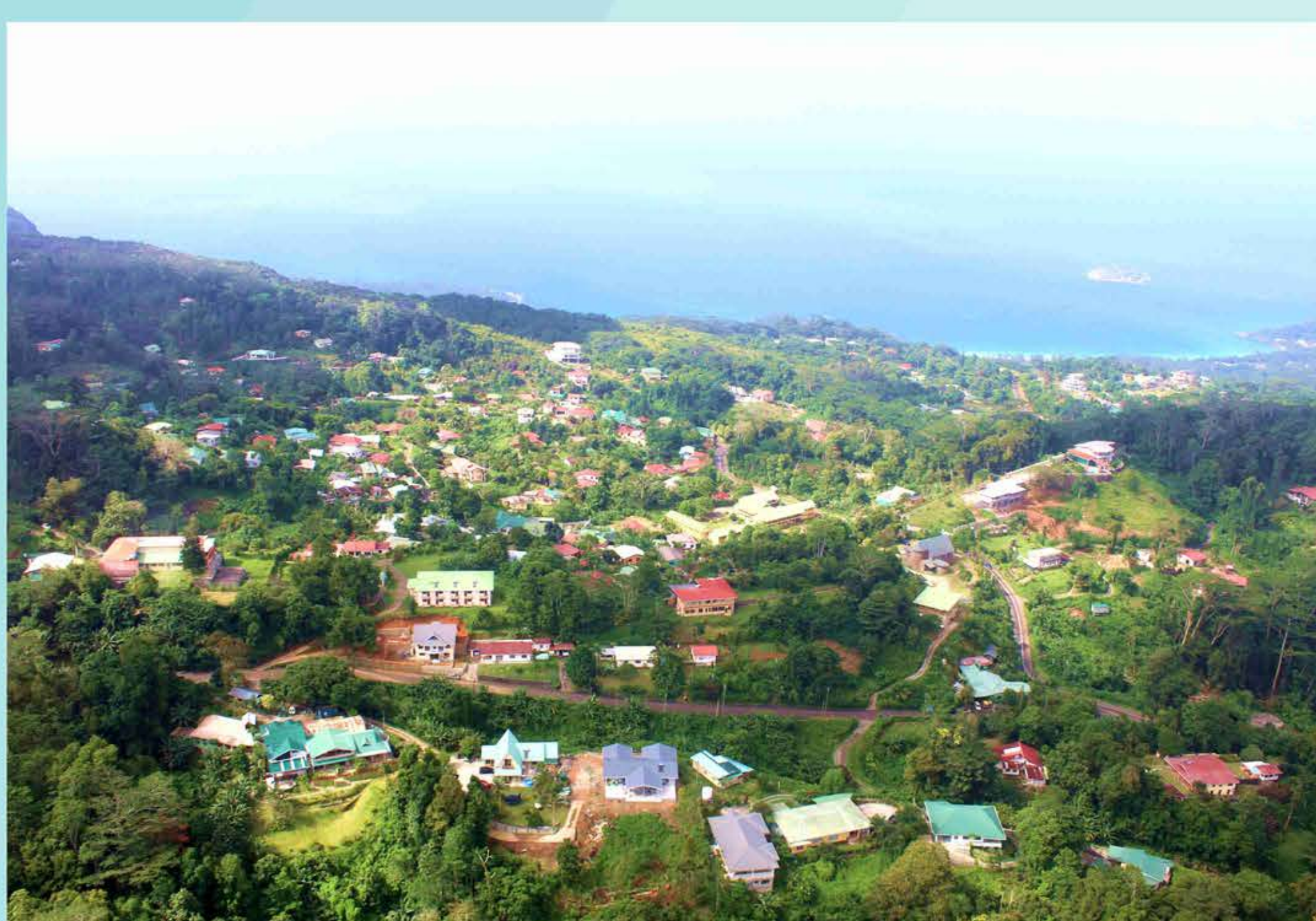
Central Mahé Island