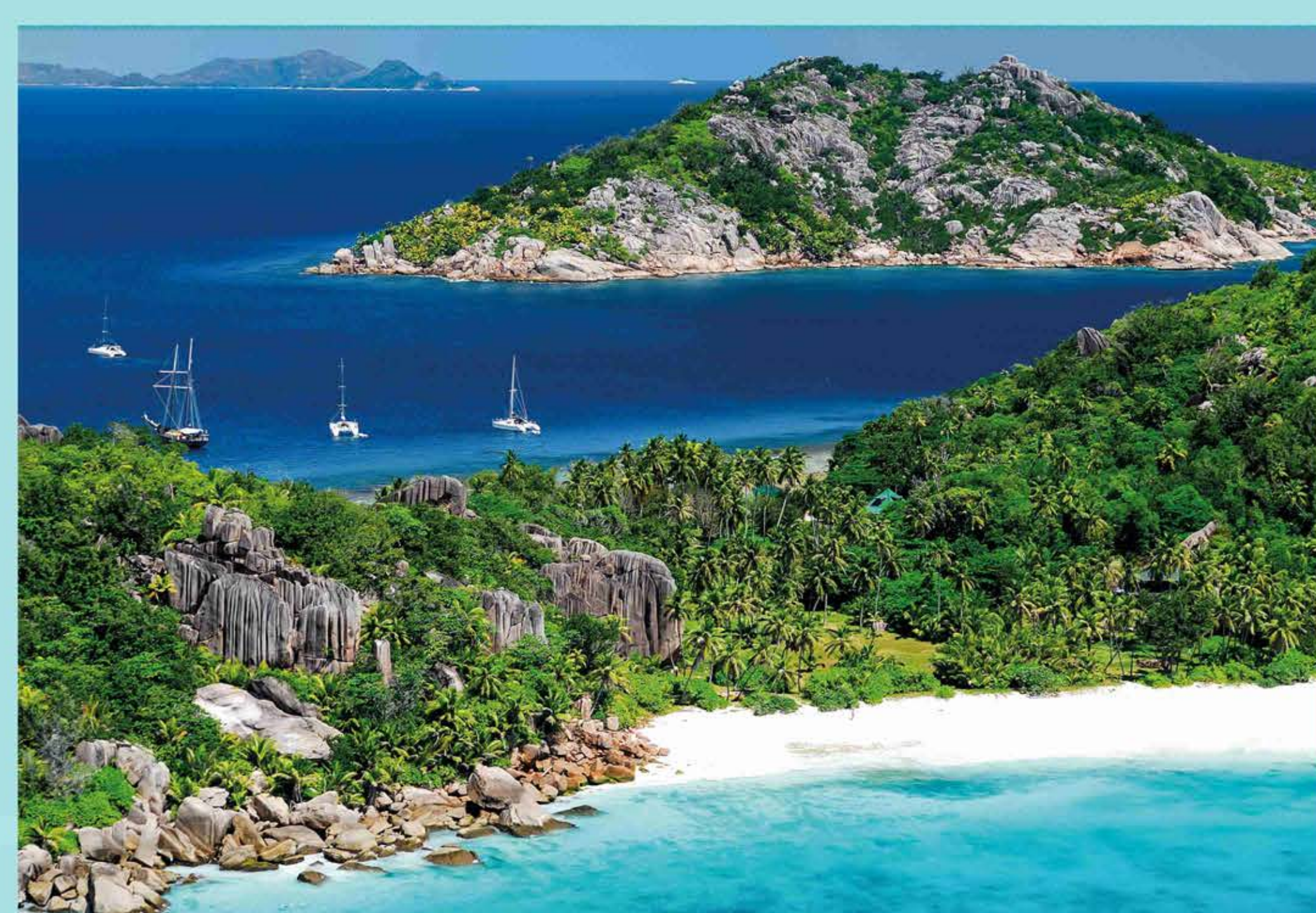
Grande Soeur Island