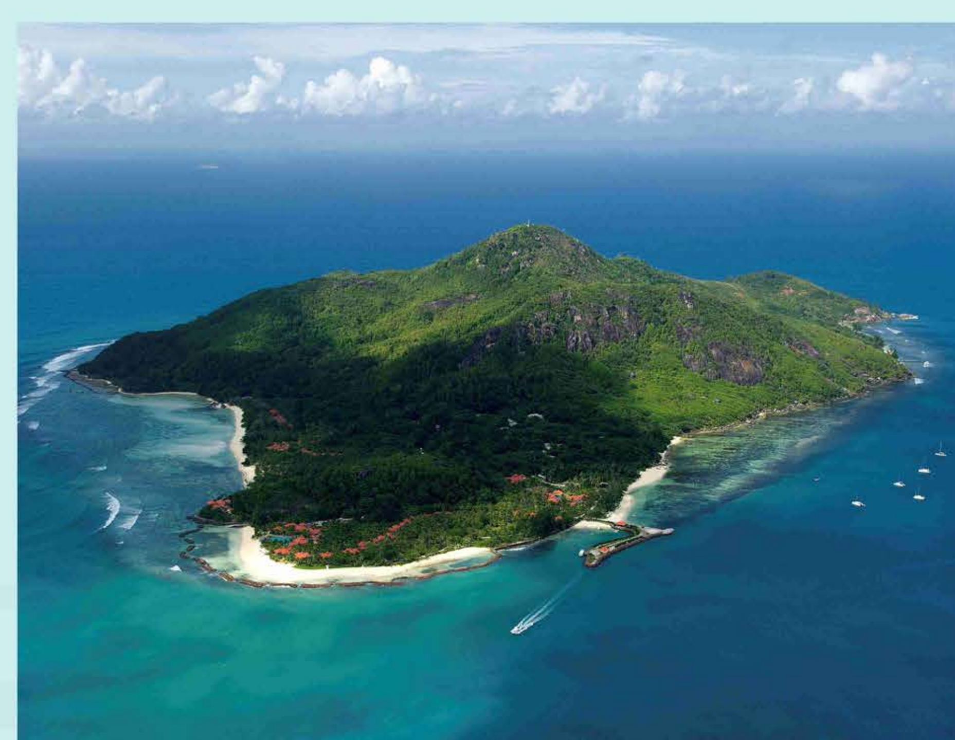
Sainte Anne Island