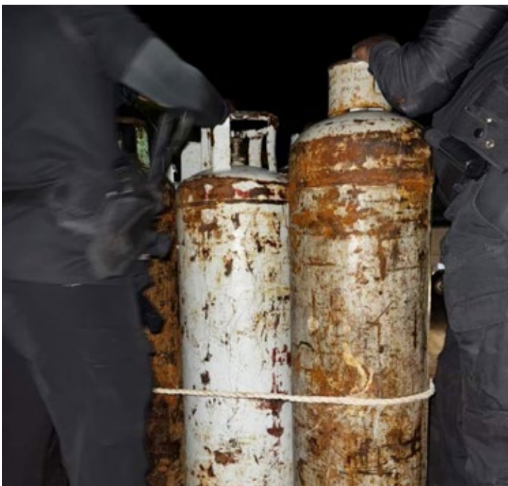
The gas cylinders retrieved by the SCG

They expressed gratitude to all local and international partners and the general public for their ongoing support in the fight against drugs. The police are encouraging community members to utilise their anonymous reporting hotline to report any drug-related activities, emphasising that public involvement is crucial in creating a safer environment for all.